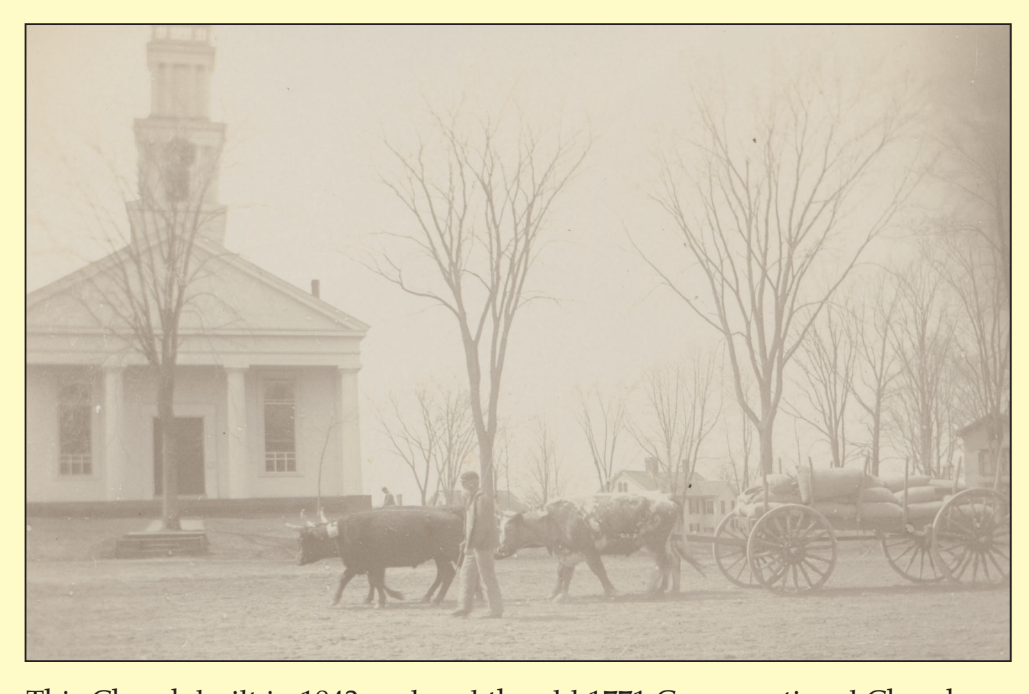
This Church built in 1842 replaced the old 1771 Congregational Church

Colchester Federated Church was established in 1949, combining the Congregational and Baptist Churches. In the late 1940's, the Baptist Church was sold and the parsonage was built. The Baker-Bunyan addition, consisting of gymnasium, lounge, library, office and Sunday School classrooms was completed also.