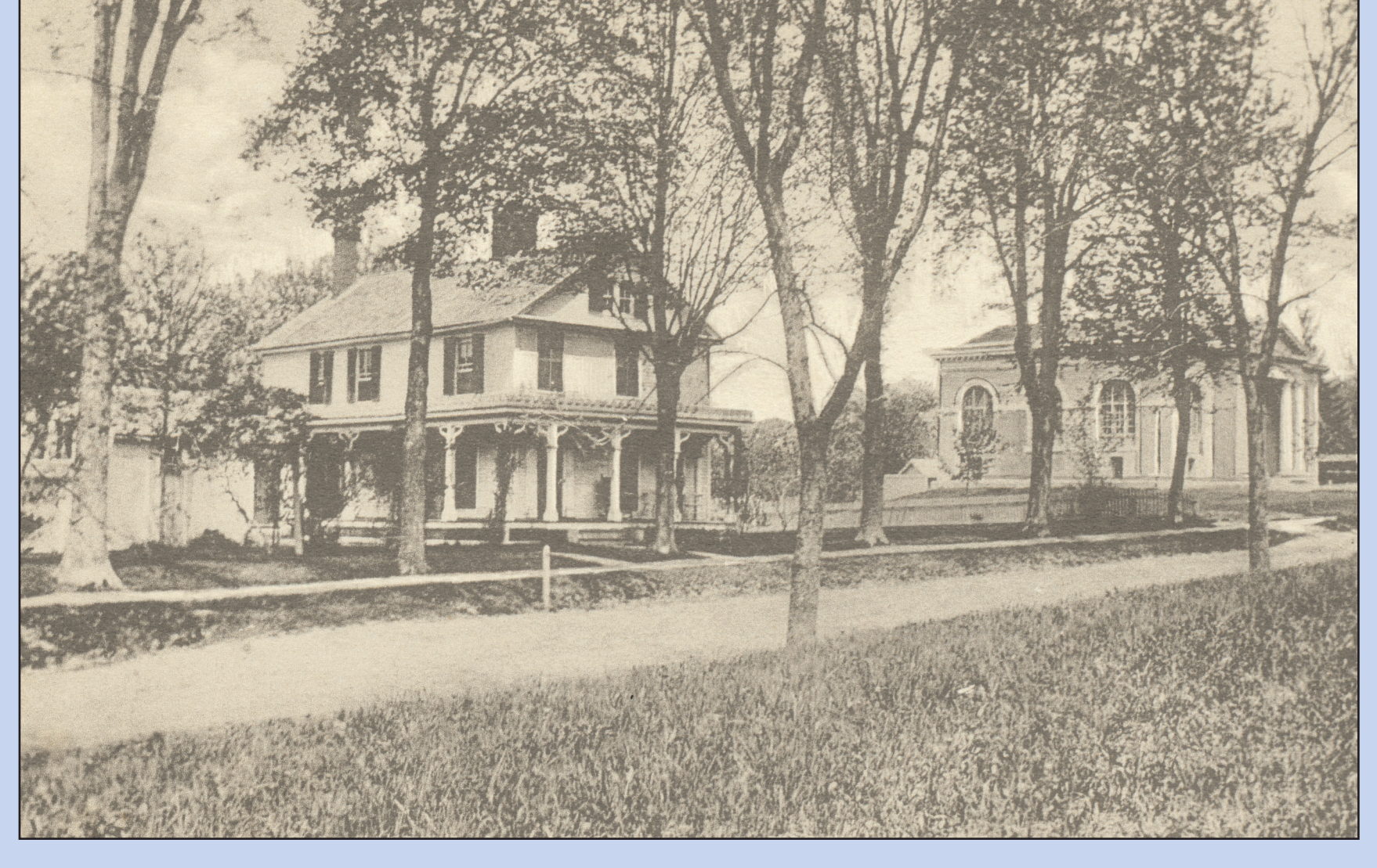
The original Ballard House on Linwood Avenue

This house changed hands several times and by the 1990's fell into disrepair. The "turquoise house", as it was familiarly known, became an eyesore in the center of town. In 2001, when the Town of Colchester voted to expand Cragin Memorial Library, the house and property, became a focal point as a solution to the enlargement of the library's parking and access